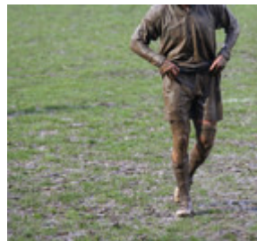
No more mud for a few months

The committee is working on a funding application to secure a maintenance programme for both of our pitches which will be actioned over the closed season to ensure that the pitches are in excellent condition and are as robust as possible for the matches in the 2010—2011 season.