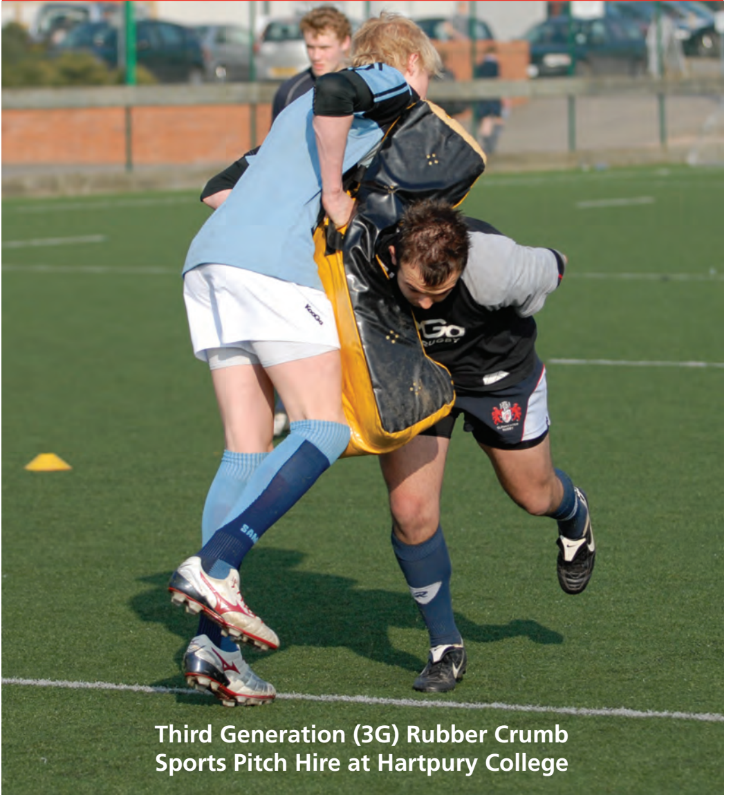
Third Generation (3G) Rubber Crumb Sports Pitch Hire at Hartpury College